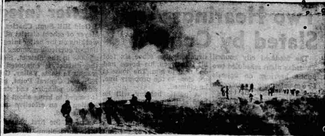
ROARING TOWARD ALTADENA, foothill brush fire is being fought by 1300 men, many flown into California from Arizona. The blaze has swept to a 25-mile perimeter and has consumed 2400 acres of tinder-dry vegetation on hilly water shed.