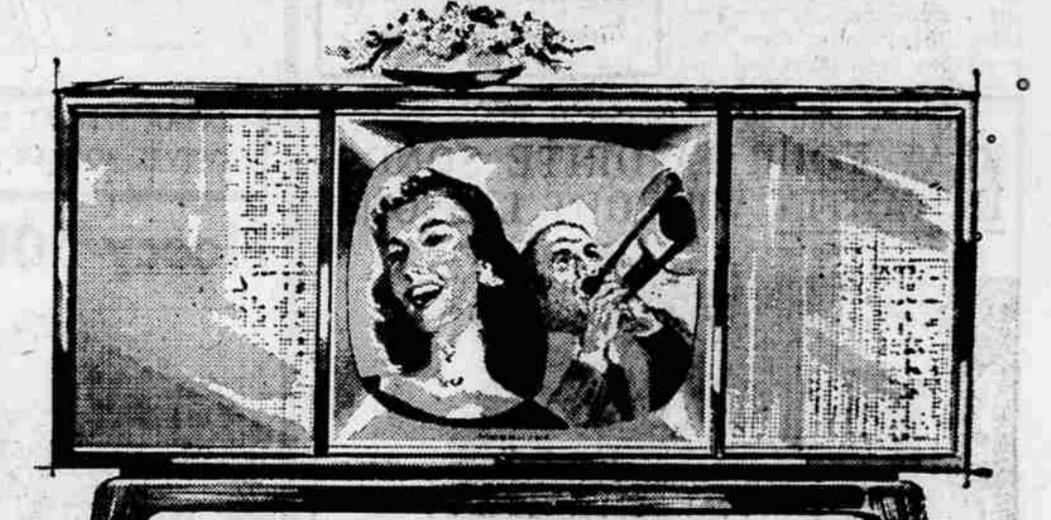
The magnificent all-inclusive Stereo Theatre

• Giant 24" Chromatic TV • Superb FM/AM Radio • Stereo Phonograph Now music becomes magic and pictures become alive to bring you the world's greatest entertainment through the wonders of Magnavox stereophonics. $595 00 Only $6.71 per Week *diagonal measure • Two sound systems in one beautiful furniture piece. • Six Magnavox speakers including two 12" bass. • Automatic phonograph with stereo Diamond Pick-up. • FM/AM radio plus big-picture 24" chromatic TV brings you the new stereo-television programs... all for the price of one! • Choose from beautiful hand-rubbed mahogany, cherry, American or light Danish walnut color finishes.