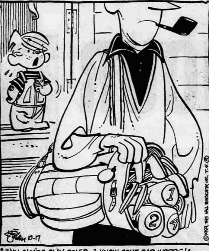
Why can't I play golf? I know some bad words!