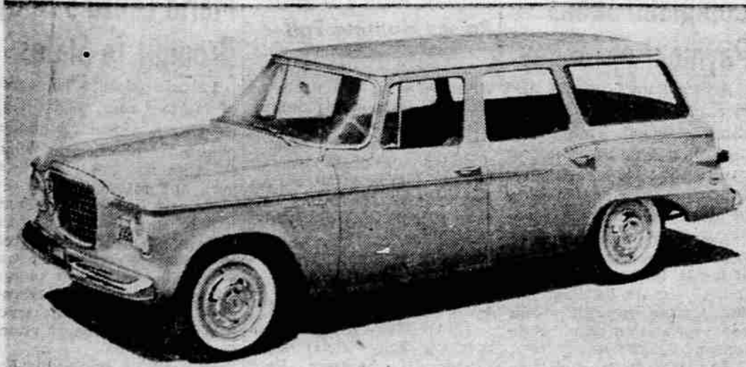
NEW STUDEBAKER —A new Studebaker model for 1960 is the Lark four-door station wagon, available with either a six cylinder or V-8 engine, shown above. The new Lark station wagons feature newly-designed tail-