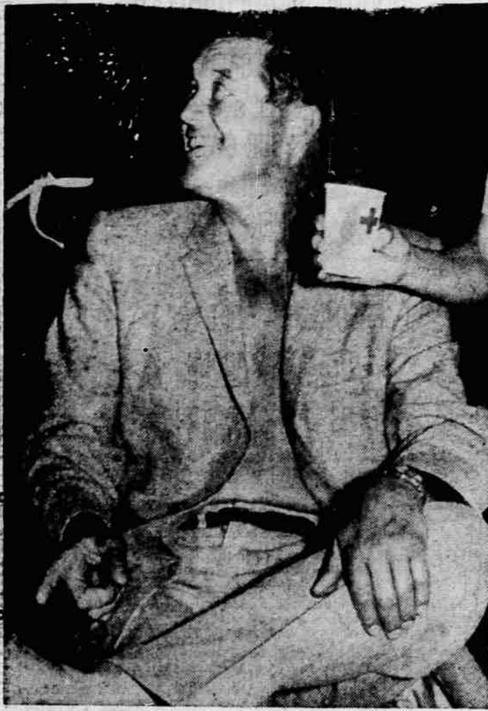
QUICK EXIT —Actor Dennis Morgan points to his bare foot which shows how he was forced to flee when flames from the wind-swept brush fire spilled over into an inhabited area around La Canada, Calif. Some three hundred residents were threatened by the fire which has now consumed some 1400 acres.

The Arctic tern is the champion long distance bird, covering an annual 20,000 miles from its breeding grounds in the north to its wintering quarters in the southern seas.