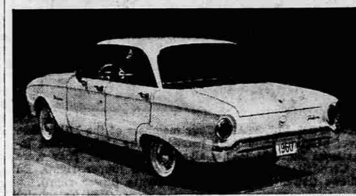
FALCON —On display at Crater Lake Motors, Main and First, Medford, is Ford company's new Falcon, shown above in three views. Functionally styled, the Falcon has a full length sculptured side panel that adds grace to its lines and provides greater strength for doors and side panels. The 90-horsepower six-cylinder engine is designed to give up to 30 per cent better gasoline mileage than standard cars.