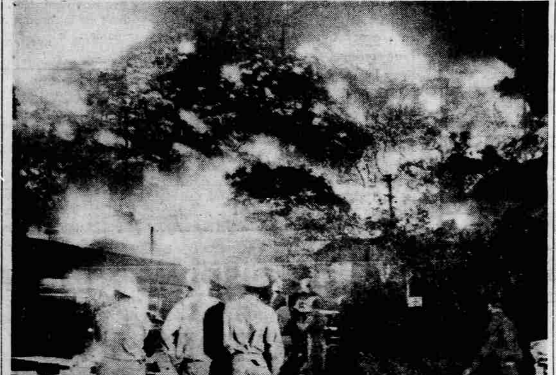
BRUSH FIRE — Firemen along the Angeles Crest highway keep a wary eye on a roaring brush fire that has blackened more than 900 acres. These firemen watch as some of the backfires they started earlier climb up a hill. Flames were reported 90 to 100 feet high in some sections.

The flames lapped over famed Arroyo Seco canyon during the night through the Brown Mountain area that was burned over in 1934 by a fire that blackened 8,000 acres. Four firemen were injured, two seriously, fighting the flames. Others were treated for burns or smoke inhalation, Hooper said. A $100,000 home in the path of the flames was partially burned but shifting winds and determined firemen, aided by home owners, turned the blaze — at least temporarily — from about 150 other homes in the area. Hooper said the Brown Mountain fire line was all but inaccessible since the one lone fire road was blocked by flames. Forecasters called for abnormally high temperatures in the 90s today with gusty desert-born winds up to 35 miles an hour on ridges and in the canyon, and low humidity — all deterrents to quick control. The fire started late Tuesday afternoon, apparently from a carelessly discarded cigarette. Several hundred persons were evacuated from their homes during the night as a precautionary measure.