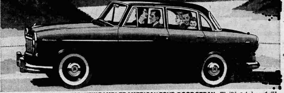
BY POPULAR DEMAND — ALL-NEW RAMBLER AMERICAN FOUR-DOOR SEDAN — Thrifties 4-door

Only Rambler Gives You the Best of Both: Big car room and comfort Small car economy and handling ease