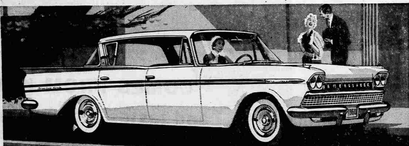
1960 AMBASSADOR V-8 BY RAMBLER — The compact luxury car in the medium-price field with new improved fuel economy.

Now see Rambler for '60. Proved by 10 years' experience in building Compact Cars. 25 billion owner-driven miles. Two full decades of pioneering in modern airplane-type Single Unit Construction.*