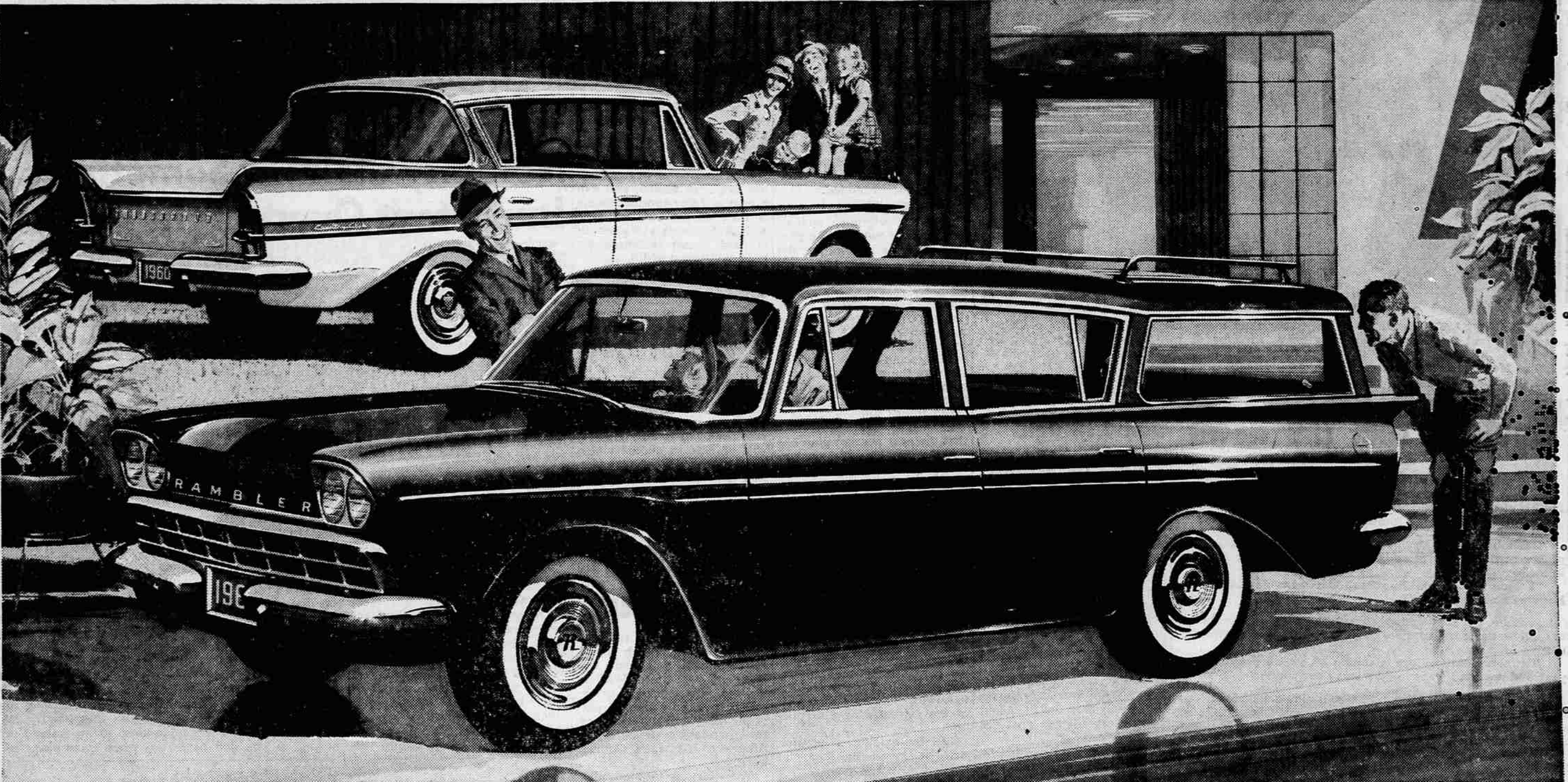
1960 RAMBLER CUSTOM CROSS COUNTRY — newest, smartest edition of America's biggest-selling compact station wagon! Six, Rebel V-8, Ambassador V-8. 2 or 3-seat models. Rambler offers America's widest choice of station wagons.