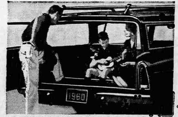
3 WIDE SEATS, 5 BIG DOORS. Room for biggest families. Swing-out tailgate has positive key lock — children can not open it. No climbing over tailgate seats to get into third seat. Easy to enter or load.

See styling that's fresh, exciting, tasteful. See entirely new models. See cars with the modern flair, but with high, wide doors that let you step in, not stoop in. See exclusive Personalized Comfort: front seats that glide back and forth separately so both driver and front seat passenger have the right amount of legroom; Airliner Reclining Seats with adjustable headrests. See for yourself that the 1960 Rambler has the perfect balance of features to make it the new standard of basic excellence. See your Rambler dealer October 14.