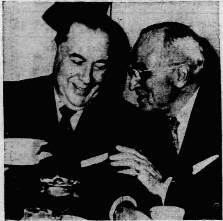
SITTING AT DINNER in Springfield, Ill., Chicago's Mayor Richard J. Daley (left), chuckles at some homespun humor served by ex-President Harry S. Truman. Dinner was part of Democratic fund-raising campaign.

Newark, N.J. — (UPI) — The number of men who wear toupees has doubled in the past 10 years, says a New Jersey wigmaker, who's found they're not as self-conscious about it as they used to be.