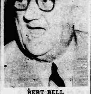
BERT BELL NFL Head Dies

Bell died Sunday in Pennsylvania University Hospital at Philadelphia while the 12