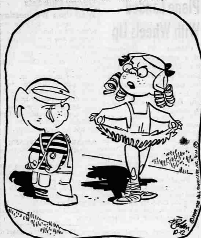
*NOT BELLY DANCER! BALLET DANCER!*