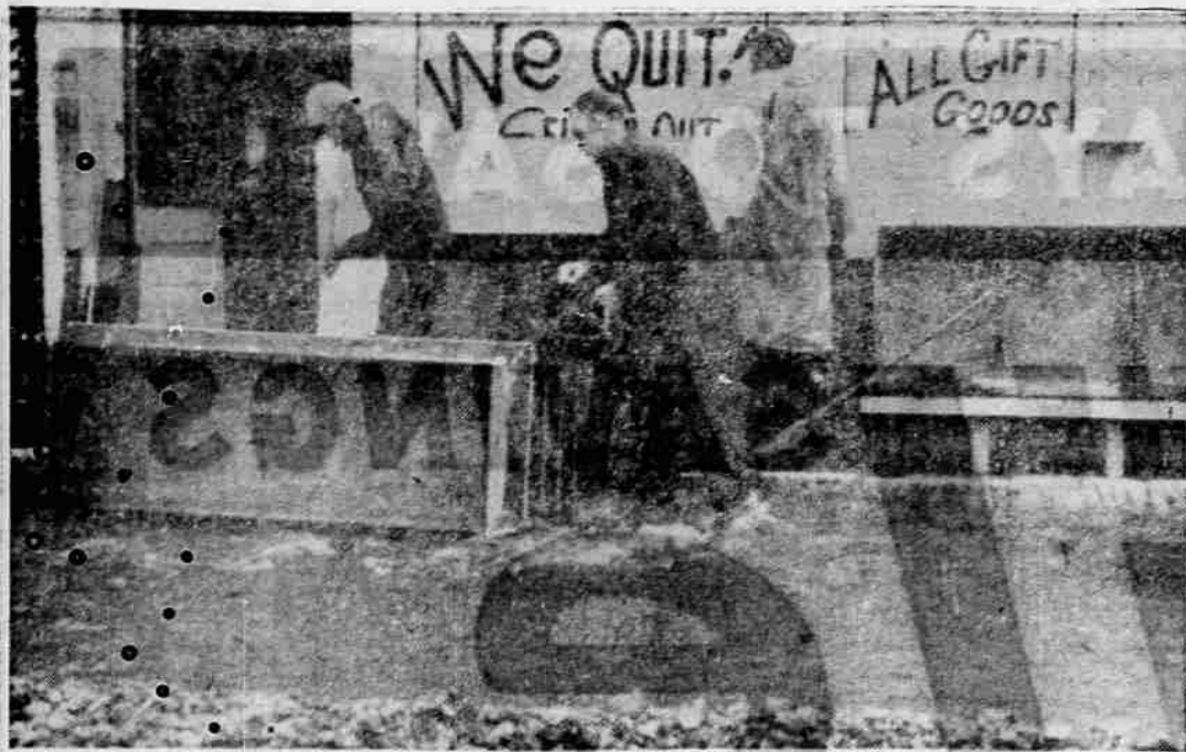
CLEAN UP —Residents of Seneca, Mo., are hard at work cleaning up after recent floods swept through their town. Shown here is a small shop displaying a sign that shows the owner's feeling after water from the flood had ruined his stock. In the foreground are rocks washed from the main street.