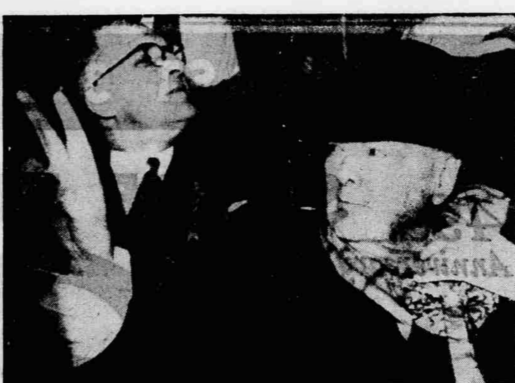
CHURCHILL'S SIGN - Sir Winston Churchill, with the brim of his hat turned down and a scarf wrapped around his neck, rides in the rear of an open car and forms a V for Victory sign with his fingers. The aged statesman rode through 10 miles of

More persons own their homes in the U. S. than in any other country.