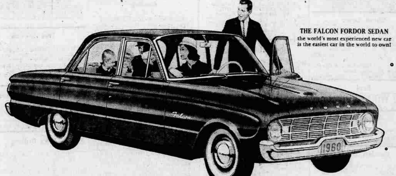
THE FALCON FORDOR SEDAN the world's most experienced new car is the easiest car in the world to own!

See "FORD STARTIME" in living color Tuesdays on NBC-TV