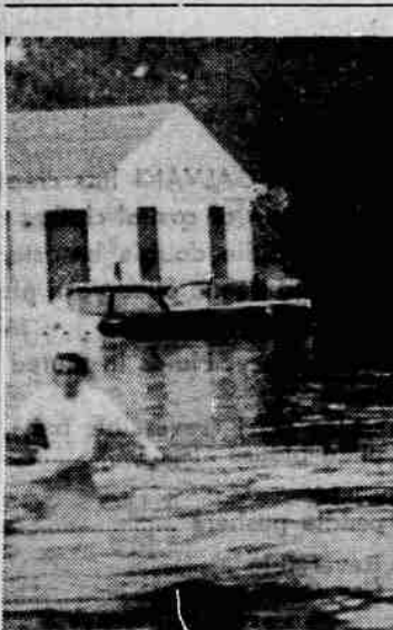
WADING WAIST-DEEP IN flash flood waters at Clearwater, Okla., these youths were among the 1000 families that were forced to evacuate area on residential section. Inundation covered several square blocks, caused incalculable damage to property.

Two placer claims on the Little Applegate river have been officially nullified, the Jackson county recorder's office has been informed. Listed in the name of Lester W. and Elvina Russell, they were known as the "India" and "May" claims. News of the nullification was received in a letter from the bureau of land management, which is pursuing a long-range program of investigating mining claims.