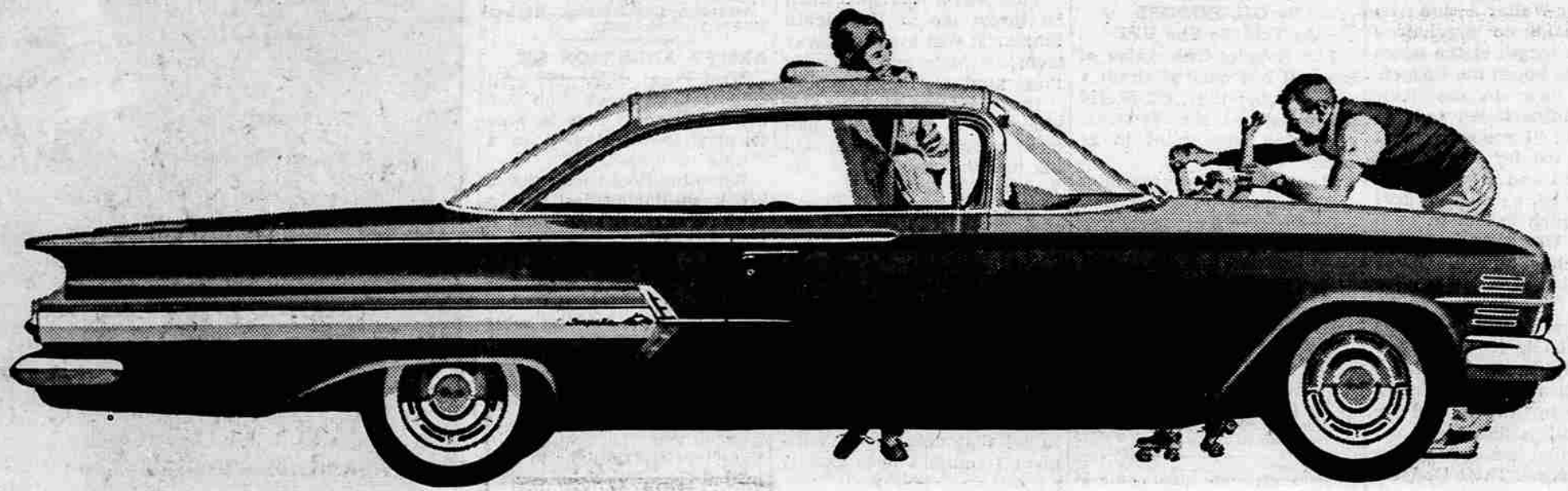
There's nothing like a new car—and no new car like a Chevrolet. This is the elegant Impala 2-Door Sport Coupe!