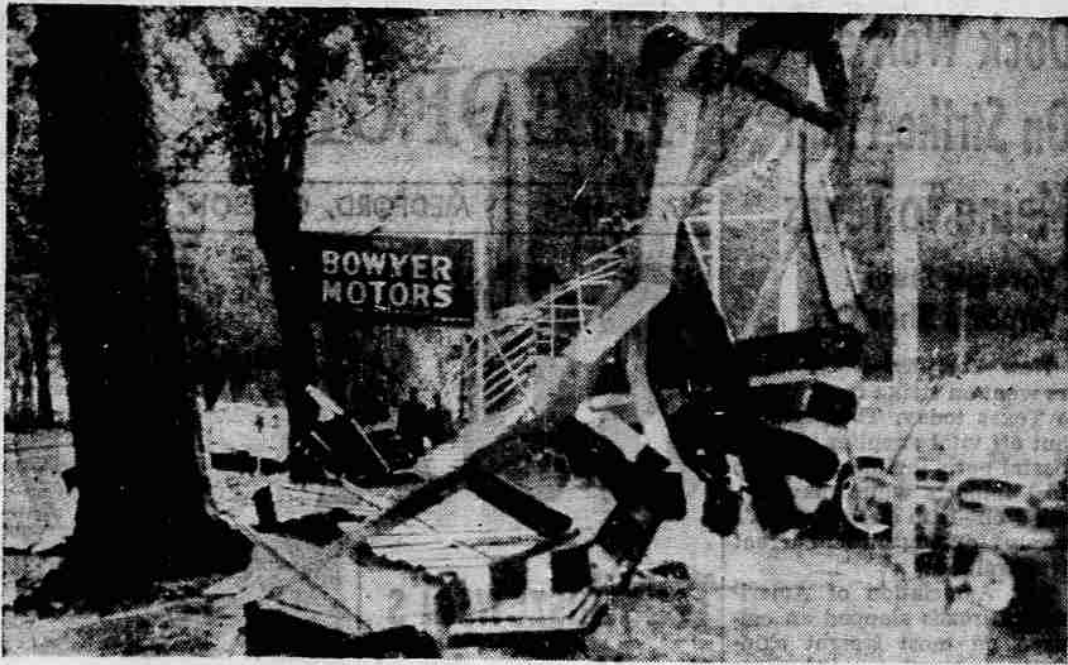
HURRICANE'S FORCE —Gale force winds lash away at the metropolitan area of Savannah, Ga., as Hurricane Gracie moves inland to the Charleston, S. C., area. This is a typical scene in Savannah as power is out, communications down and traffic blocked by fallen trees and limbs. Many businesses have lost signs and awnings as the 60-mile-an-hour winds continue to strike.

"We will definitely liberate Taiwan and other islands," No U.S. Correspondents Reports on the Peiping festivities were carried by Peiping Radio and the Soviet Tass news agency. No American correspondents were granted visas to cover the celebrations and the meetings between Premier Nikita Khrushchev and Chinese