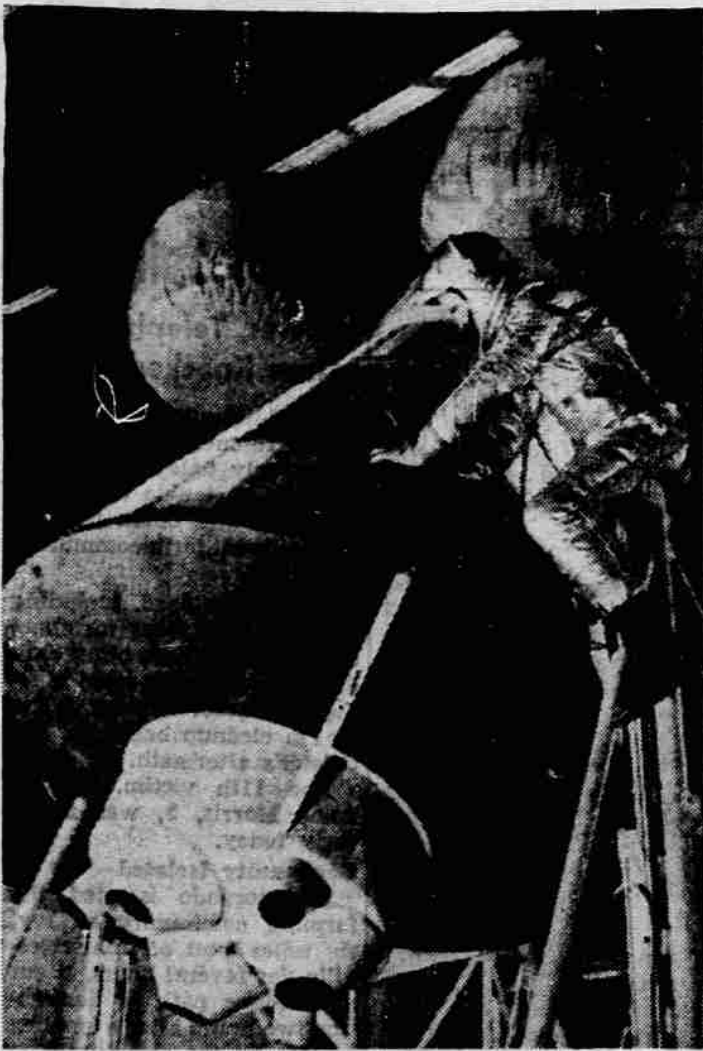
SPACE CAPSULE MOCKUP —First view of the McDonnell space capsule mockup shows a pilot preparing to climb through the entrance hatch of the manned satellite being built for NASA. The picture was taken at the McDonnell Aircraft plant at St. Louis, Mo. At lower left are the retro-rockets, while above the pilot are the flotation bags which give the capsule buoyancy and stability in the water.