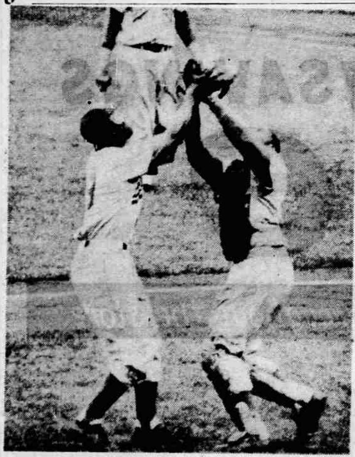
PLAYERS COLLIDE —Dodgers' Third Baseman Jim Gilliam, left, and Catcher John Roseboro collide in foul territory as they make a play on a pop foul off the bat of Andy Pafko, of the Braves, in the third inning Monday. Roseboro caught the ball and held on to it despite the collision.