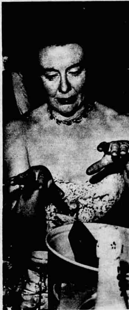
Mrs. Kefauver, wife of Senator from Tennessee, reaches across ice bucket.