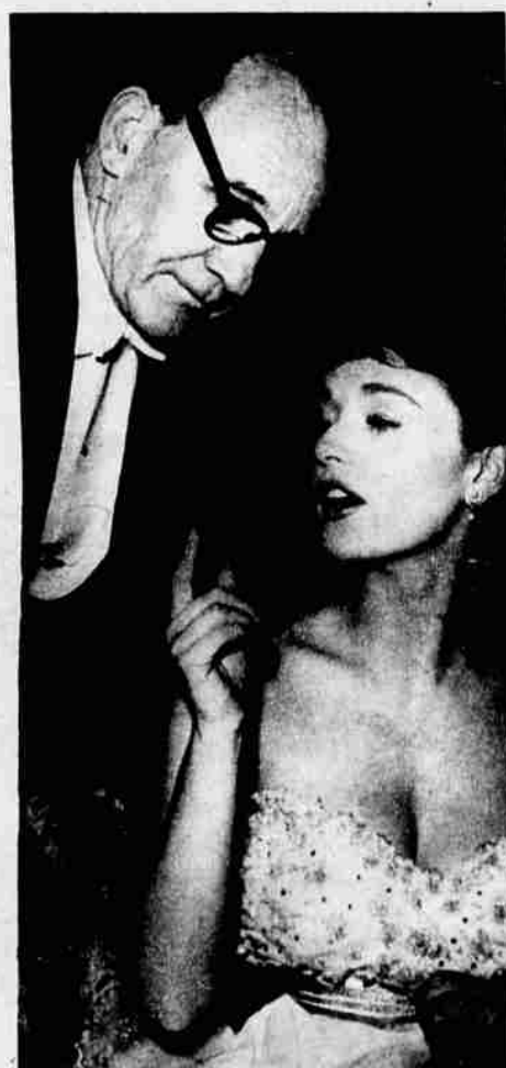
Arkansas Senator John McClellan harkens to golden voice of singer Anna Maria Alberghetti at fashionable party.