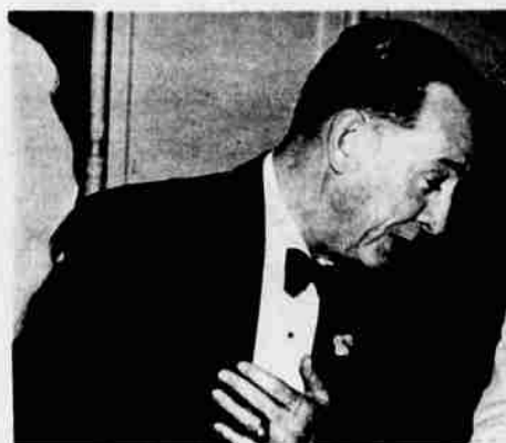
Air Force Gen. Thomas D. White bows to friend at Notre Dame club dinner.