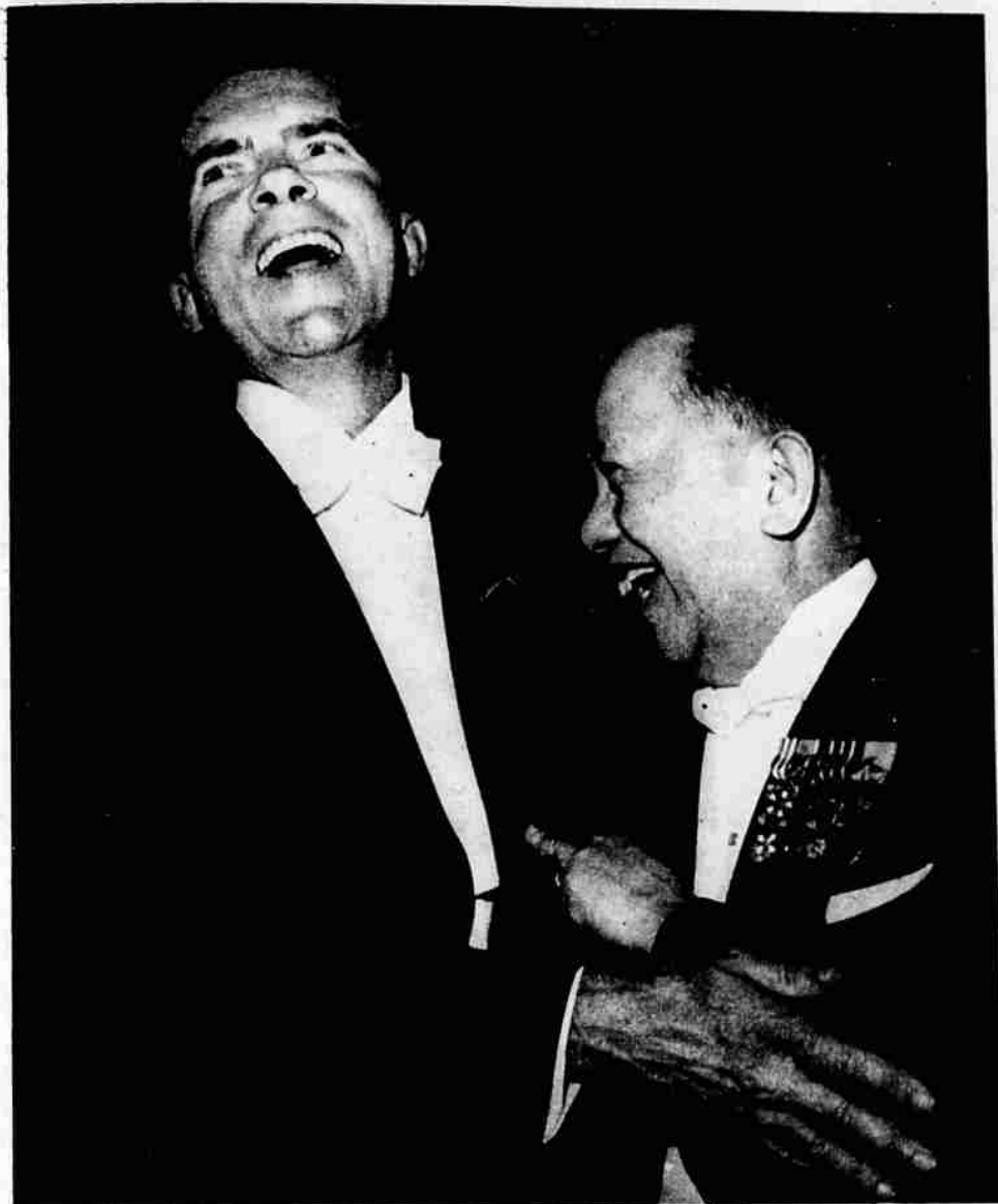
Vice President Richard Nixon shares hearty laugh with bemedalled Philippine Ambassador Carlos P. Romulo at Nicaraguans' party for Nixon.