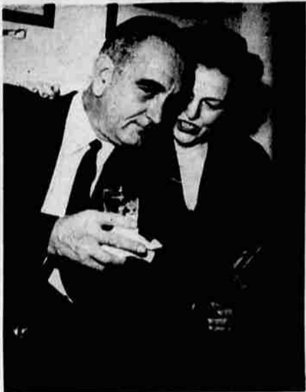
Conspiring in a corner, Senator Lyndon Johnson of Texas and former Congresswoman Helen Gahagan Douglas chat.