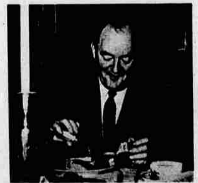
At Board of Trade luncheon Sen. Humphrey of Minnesota sprinkles salt.