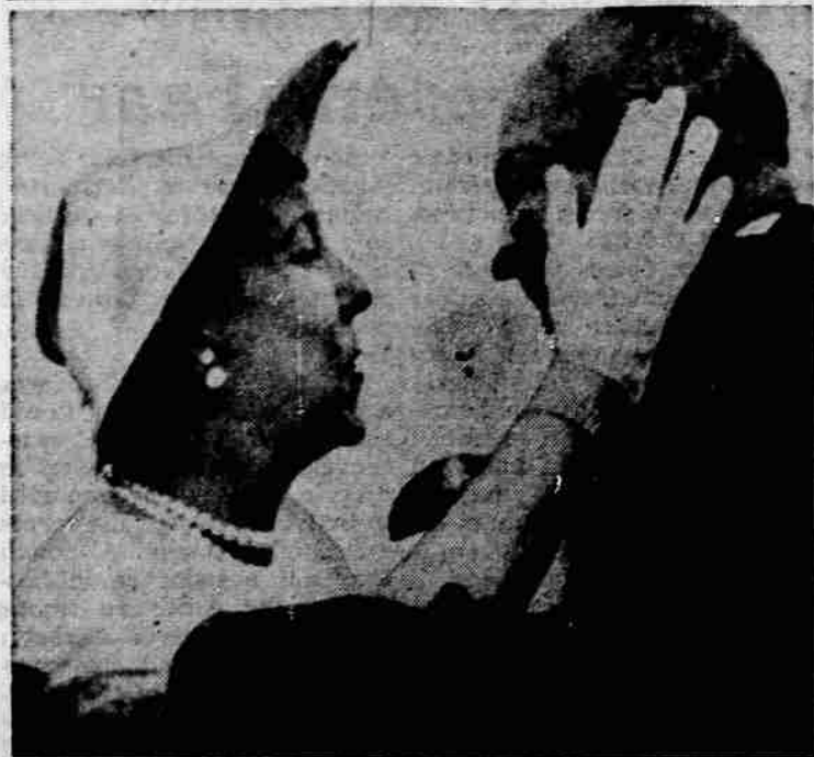
RETURNING TO CAPITAL , President Eisenhower is warmly greeted by Mrs. Eisenhower after triumphant policy-making swing through Western Europe during which he conferred with leaders on cold war.