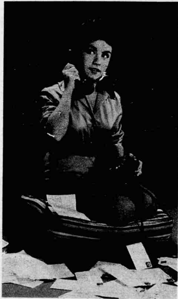
Fans see themselves in Annette Funicello, a talented "hep teen-ager," typical of today's famous youngsters.

Ex-model Carol Lynley, unlike the others, seems bent on alienating the people who put her