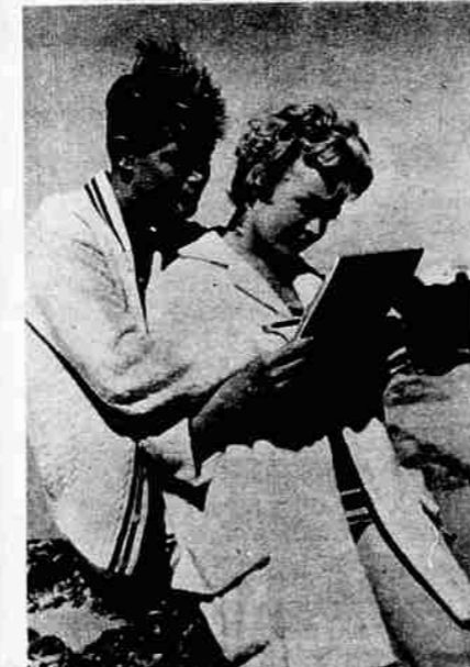
Sandra Dee, 17, filmland's busiest teen, rehearses with Troy Donahue.