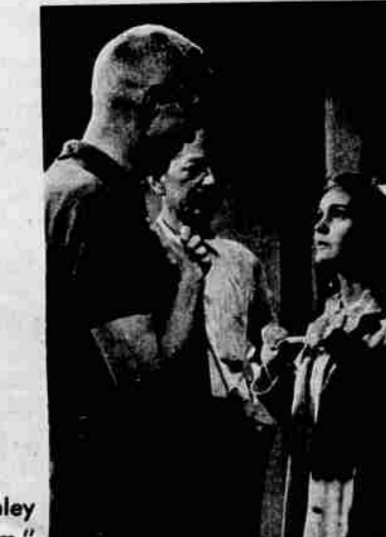
Philip Dunne directs Carol Lynley in her role for film "Blue Denim."