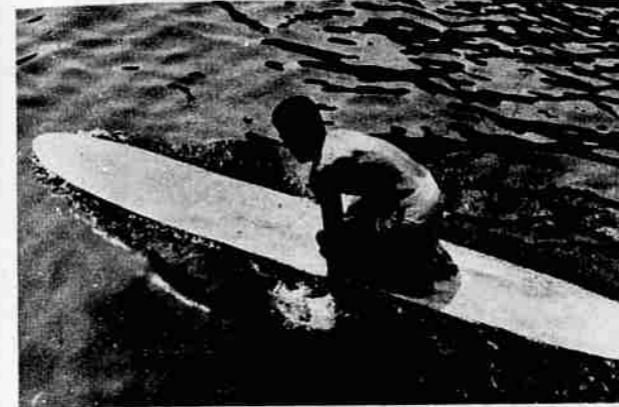
A pending divorce hasn't decreased the popularity of James Darren, 23.