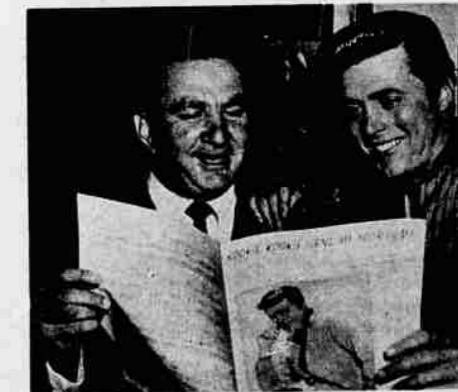
Kids flip for TV's Edd "Kookie" Byrnes (right), the "old man" among them at 25.