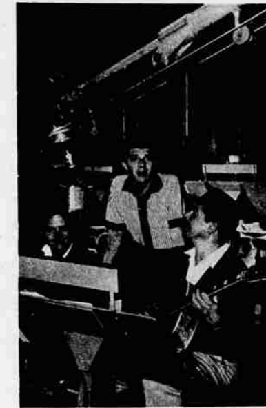
For singer Frankie Avalon, being an idol means lots of hard work.