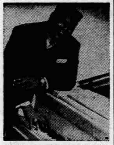
ROCK 'N ROLL —Fats Domino (above) of "Blueberry Hill" fame will appear with his orchestra at the Medford Armory Saturday night, Aug. 29. Domino has won 18 gold records during his career. Dancing Saturday night will be from 9 p.m. until 1 a.m.