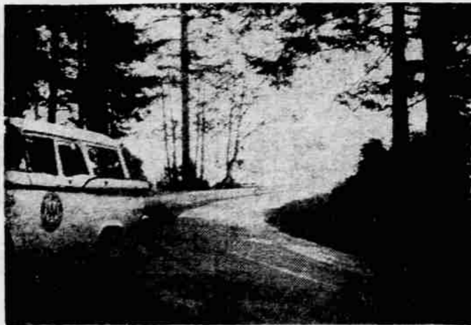
Typical of the Bradley Loops section of US 30 near Bradley state park is this scene. The tortuous, curving, narrow section of road is still used to reach the park, but has been bypassed by a recently completed new highway section.