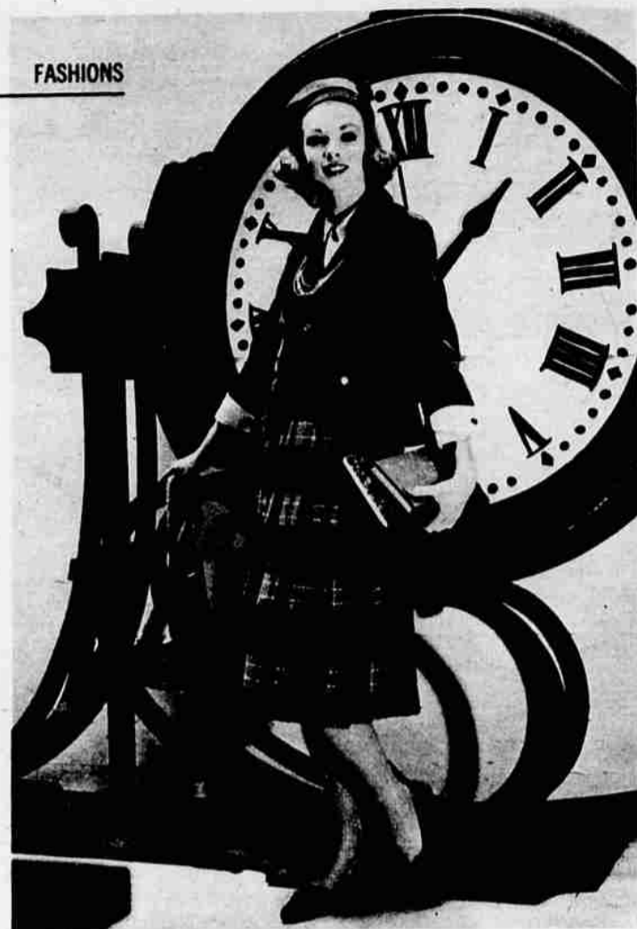
Classes begin with a short velveteen jacket paired with a plaid wool skirt and a cotton shirt. The entire ensemble by Wipette ($36).