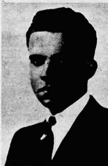
Nixon's senior-class photograph at Whittier College.