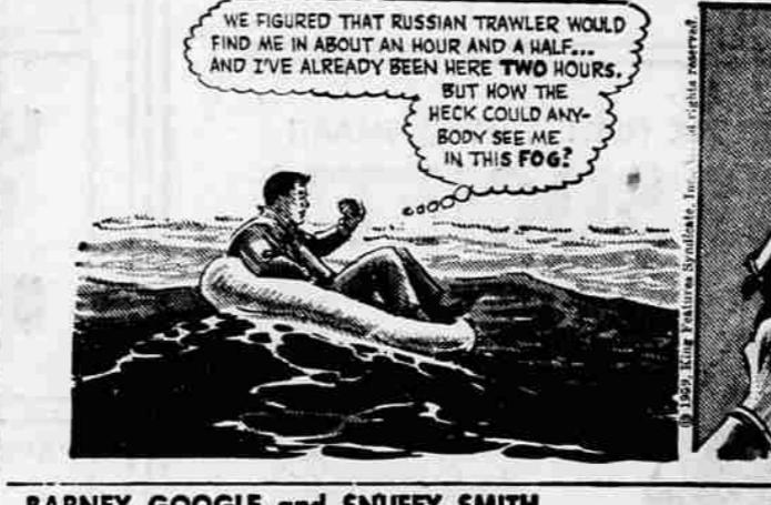
BARNEY GOOGLE and SNUFFY SMITH