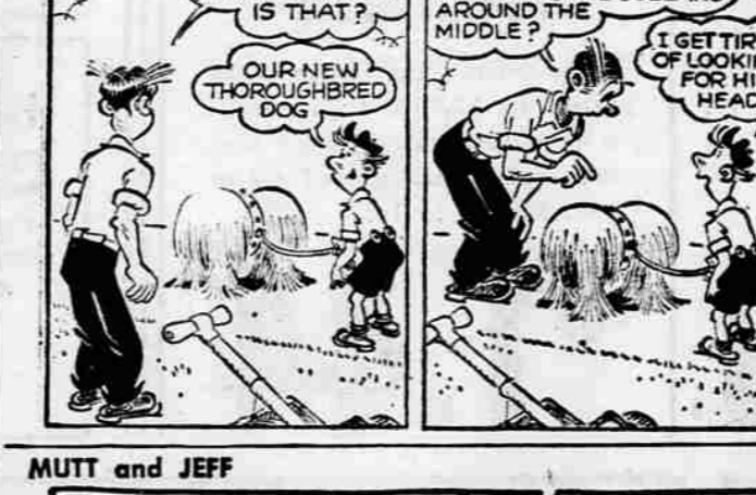
MUTT and JEFF