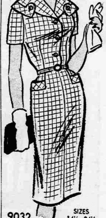
9032 SIZES 14 1/2-24 1/2 by Marian Martin

Wide collar poised on a slimming sheath—a smart line, and so flattering to short, fuller figures. Choose cotton, crepe, or wool—jewel button trim. Tomorrow's pattern: Misses' skirt. Printed Pattern 9032: Half Sizes 14 1/2, 16 1/2, 18 1/2, 20 1/2, 22 1/2, 24 1/2. Size 16 1/2 requires 4 1/4 yards 35-inch fabric. Printed directions on each pattern part. Easier, accurate. Send FIFTY CENTS (coins) for this pattern—add 10 cents for each pattern for first-class mailing. Send to Marian Martin, Medford Mail Tribune, Pattern Dept., 232 West 18th St., New York 11, N.Y. Print plainly NAME, ADDRESS with SIZE and STYLE NUMBER.