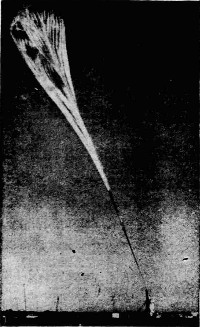
GOING UP —Moments before launching, a 200-foot plastic balloon is pictured at Lake Elmo, Minn. The balloon, expected to reach an altitude of 80,000 feet, is equipped with a remote-controlled camera (bottom) designed to take pictures of the Sun. The launching is the second in the Stratoscope I Project.