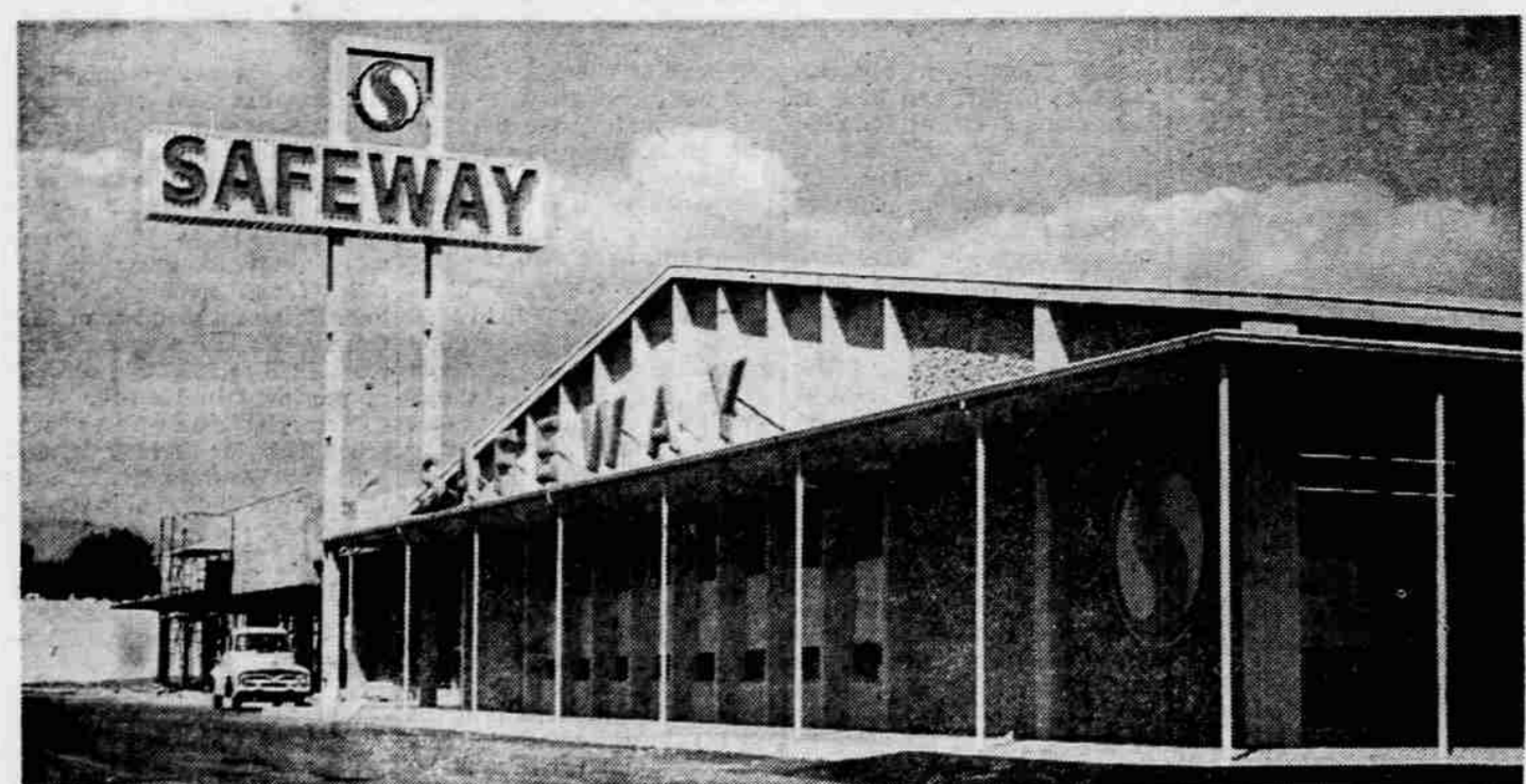
SAFeway STORE — Shown above is the new Safeway store in the Medford Shopping Center which will open tomorrow. Grand opening festivities will be observed throughout the three stores in Medford, Safeway officials