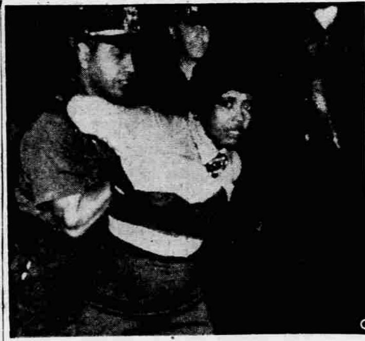
MOVING QUICKLY to quell a riot of 300 to 400 persons in St. Paul, Minn., police officers seize unidentified woman, pinion her arms behind her as she resists them. The trouble grew out of a police request of a Negro to identify himself. Unruly mobs gathered from nearby bars.

Imagine voting billions of dollars of bonds to build national highways that will be worn out or outdated when the time comes for our children or our grandchildren to dig into their pockets to pay off the bonds.