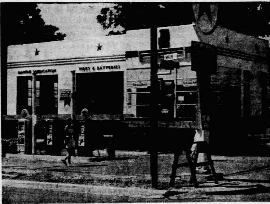
BUILDING MOVED —This Texaco service station building at the corner of East Main and Hawthorne sts., Medford, was "whisked" away early Saturday morning, Aug. 8, to reveal a brand new building directly behind it. The picture above shows the structure cribbed up and "ready to roll," before it was moved to a lot on Court st. by Contractor Stan Parrish. The change has made it possible for the station to add two more pumps and a second lube rack, in addition to other improvements. One innovation of the modernized station is an overhead grease supply unit. The station is owned by Bud Peebler.