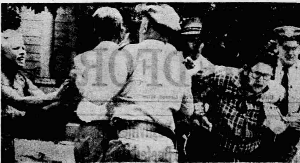
MOVING IN WITH NIGHT STICKS, Little Rock, Ark., police subdue group of demonstrators who tried to prevent Negroes from entering Central High School. Man in checked shirt is bleeding from head wound after being clubbed during riot.

and the BIG Y APPLIANCE CENTER Ph. SP 3-3052