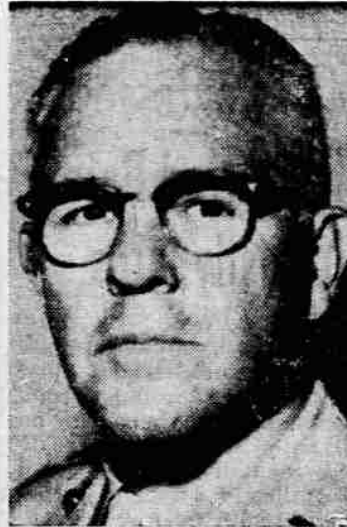
AWAITING confirmation by Senate is Maj. Gen. David M. Shoup, nominated by President to be Commandant of U. S. Marine Corps.

Washington - (UPI) - The United States made public this week end plans for setting up a new international lending agency designed to help under-developed countries in the cold war economic struggle. The proposed new agency - The International Development Association - would be an offspring of the World Bank. It would provide development loans to countries which ordinarily have difficulty getting money from private sources or the World Bank. The recipient nations could pay back the loans in their own currencies rather than pounds or dollars. The setting up of IDA has been discussed by experts of World Bank member countries for about a year. The outline of the program was prepared by the National Advisory Council and submitted to President Eisenhower by its chairman, Secretary of the Treasury Robert B. Anderson.