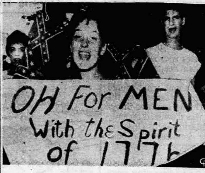
WEARING HEAD DRESS of small Confederate flags. Raney High School girl holds up one of many signs carried by students protesting integration of two of four Little Rock High Schools due to take Negro pupils.