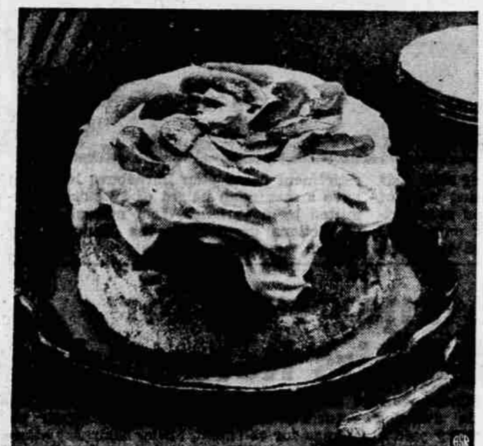
This luscious looking dessert—surprising as it seems—is a boon to calorie counters. It's made with dietetic peaches and a dessert topping mix that adds only 17 calories for each creamy-rich tablespoonful of topping. The topping is stored on your pantry shelf... keep a package on hand for a quick dress-up for fruit, low-calorie puddings, or cakes.

Peach Angel Food Dessert 1 package angel food mix 1 package Dream Whip dessert topping mix 1/2 cup cold milk 1 can (8 ounces) dietetic sliced peaches 1/2 teaspoon vanilla Prepare cake and dessert topping mix as directed on packages. Cool thoroughly. Spread half of the topping over the cake. Arrange peach slices on topping. Serve cake with remaining dessert topping mix.