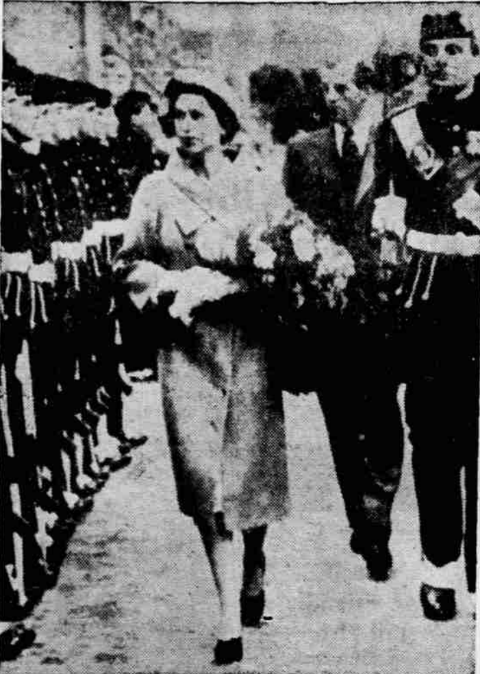
ROYAL REVIEW —Britain's Queen Elizabeth II reviews honor guard on her arrival at Ballater, Scotland while enroute to summer holiday at royal residence at Balmoral with her husband and two children. As queen arrived, palace sources in London announced that she is expecting her third child next year.