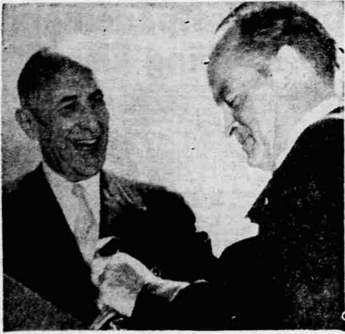
RECEIVING THE NAVY'S Meritorious Public Service Citation, Bob Hope (right) bows his head as Navy Secretary William B. Franke beams his approval. Award was made aboard the aircraft carrier USS Yorktown at Seattle, citing Hope for his entertainment of servicemen throughout the world. He also received honored lapel pin.