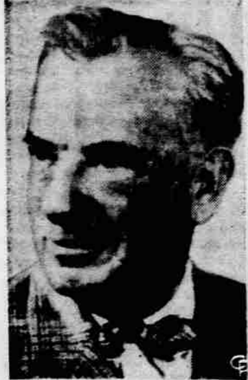
SUCCUMBING to cerebral hemorrhage, Edgar A. Guest, 77, noted poet, is dead at home in Detroit.