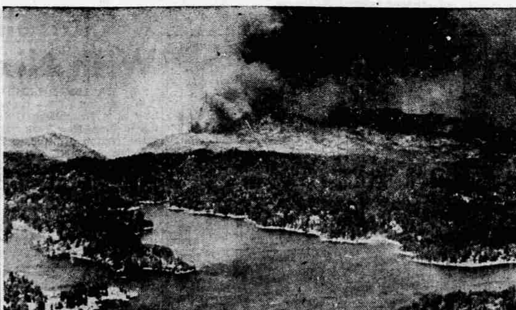
RIISING HIGH IN SKY , smoke marks forest fire in Lake Gregory area, San Bernardino National Forest, which has blackened more than 10,000 acres. It is being fought by more than 1,500 men. Lake Arrowhead is in foreground. No homes are menaced.