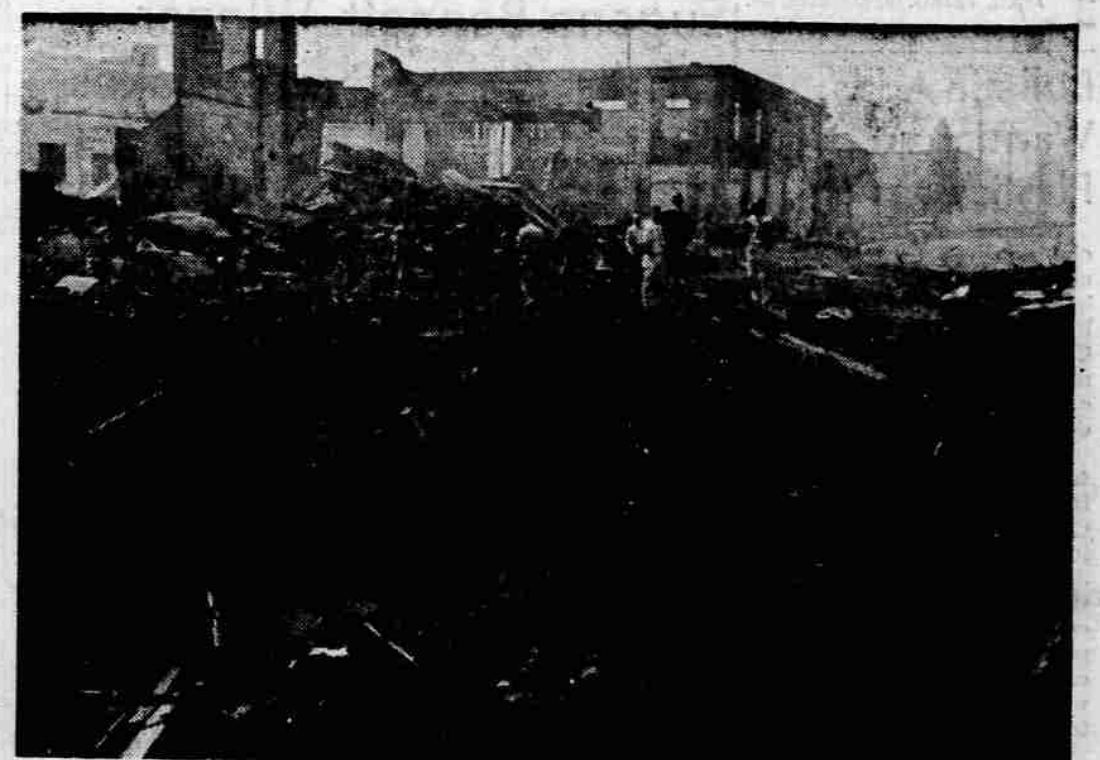
THIS CRATER IS WHERE TRUCK EXPLODED