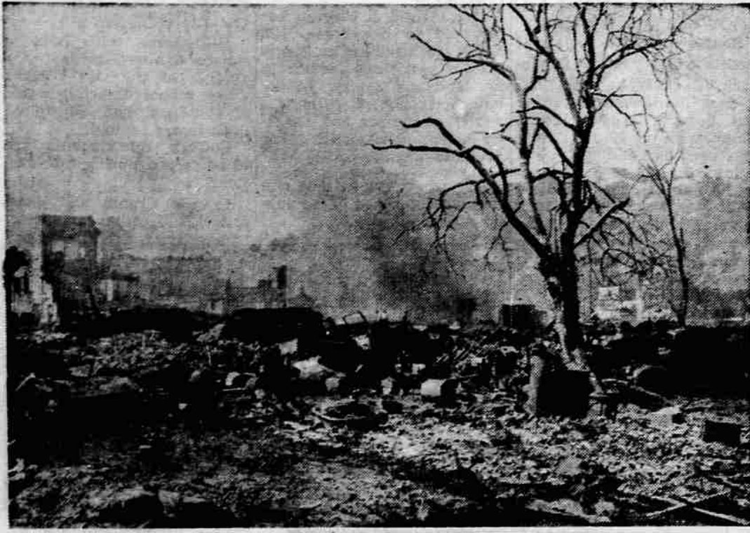
DESTRUCTION SHOWN IN DOWNTOWN ROSEBURG