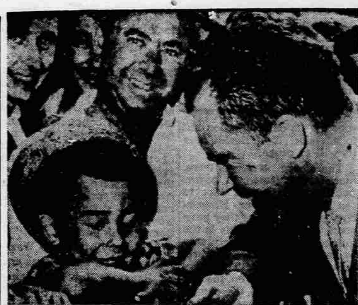
LET'S CHAT —U.S. Vice President Richard Nixon chats with a small boy at Sverdlovsky, Russia, during his tour there. Speaking in this Siberian city Nixon hinted of a possible visit to the U.S. by Soviet Premier Nikita Khrushchev.

About 40 per cent of the area of Missouri is forested.