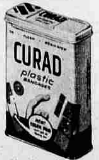
Curad bandages for cuts, scratches; Telfa sterile pads for larger wounds.

Flesh color or transparent for adults, Bat- tle Ribbon colors and designs for the kids. Medicated. Waterproof.