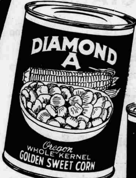
DIAMOND A WHOLE KERNEL GOLDEN SWEET CORN