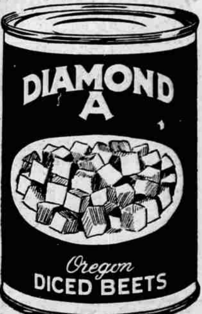
DIAMOND A DICED BEETS