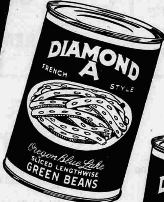
DIAMOND A FANCY SLICED GREEN BEANS