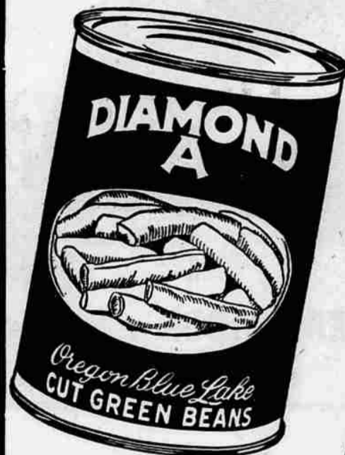
DIAMOND A FANCY CUT GREEN BEANS