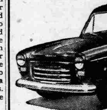
The Deluxe Anglia