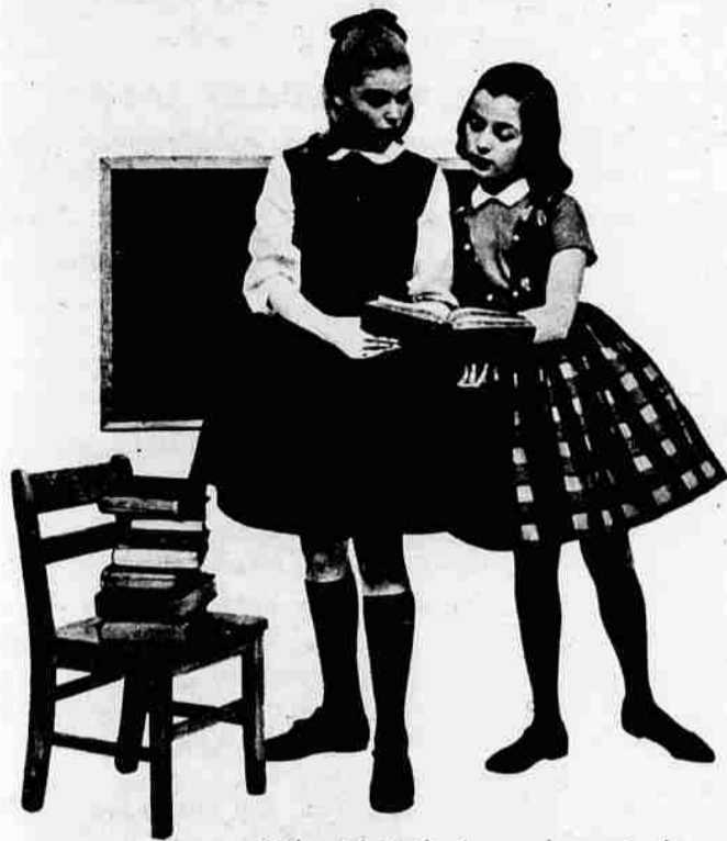
Little girls in the know choose Jack Borgenicht's corduroy jumper and striped shirt ($9) or a woven plaid by Cinderella ($9).

B ACK TO SCHOOL! Why so soon? Summer is only a few weeks old. But it's a wise mother who starts early to plan her children's new school wardrobe.