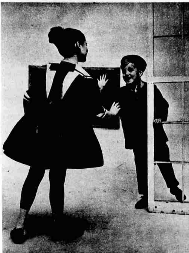
Hellos and hurrahs go to the charmer in the Voila cotton with back interest ($17). For her admirer it's an interlined corduroy coat ($8) and pants ($4) by Hi-Line.