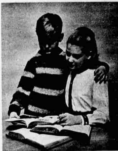
Seen together in the study hall: shag sweater by Robert Bruce ($6) and Macshore's blouse with color lace trim ($4).