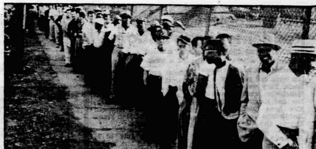
STANDING IN LONG LINE, striking steelworkers head for pay windows at Chicago's South Works of United States Steel Co. to receive pay due them when they quit.

"All of which again proves individual stocks move in individual patterns," the magazine adds. "As one old-timer recalls: 'Western Union was awfully strong in the early days of the 1929 crash. After all, they did a tremendous volume sending out all those margin calls.'"