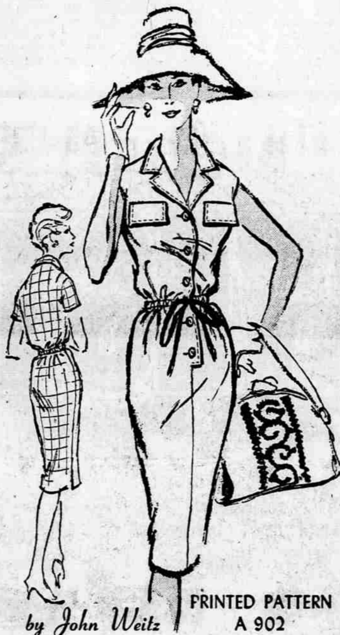
by John Weitz PRINTED PATTERN A 902

The Shirtdress by the John Weitz, winner of the 1959 Designer of the Year Award for his achievements in designing sportswear, is yours for the making when you use our Printed Pattern A902. Notice the modern, streamline and subtle strategy in cut - expertly classic yet with a sophisticated casualness. Notice the drawingstring waist - utterly simple to make so you will want to have it in a dozen fabrics from cotton to jersey to silk. The John Weitz know-how in this pattern guides you in a few brief pleasant hours every stitch of the way. Take advantage of his genius.