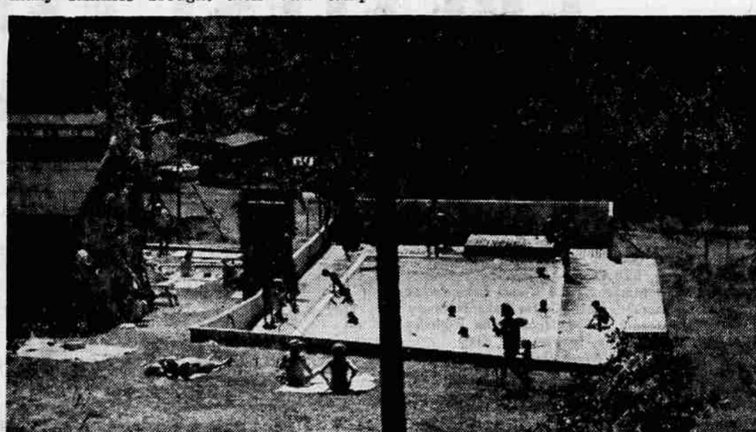
SWIMMING POOL —From the road that leads to the camp area on the grounds of White Oak lodge, one looks down on the swimming pool and badminton and volleyball courts beyond. Grassy slopes, where sunbathers may relax, are kept neatly mowed. Nudists often put on a shirt or jacket if the weather is chilly, or if the sun gets too hot on bare shoulders.

Not only is it good exercise, but it helps them cool off between sessions in the sun. The lodge itself consists of several cabins, a good-sized concrete swimming pool, a snack bar and the main house where the owners live, in addition to volleyball and badminton courts and several pieces of playground equipment for children. Now under construction is a 50-foot circular pavilion with a fireplace in the center which will serve as a place to hold community barbecues. Other conditions are planned for the future, according to the owners.