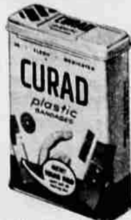
Curad bandages for cuts, scratches; Telfa sterile pads for larger wounds.

Flesh color or transparent for adults, Battle Ribbon colors and designs for the kids. Medicated. Waterproof.