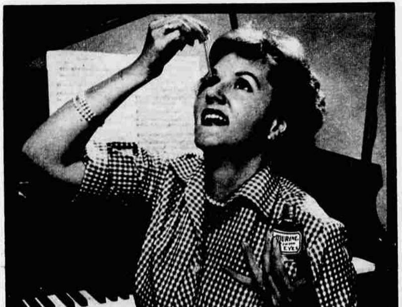
MARGARET WHITING, FAMOUS SINGING AND RECORDING STAR

"How I use Murine to soothe my eyes and so relax tension"