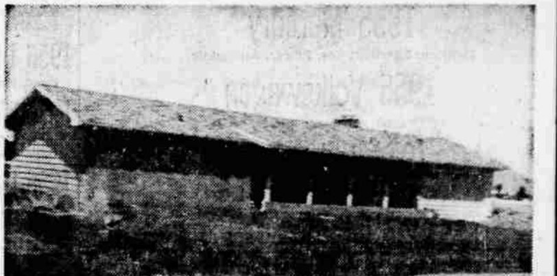
NEW HOME UNDER CONSTRUCTION