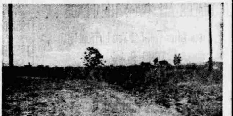
SITE OF NEW OSTEOPATHIC HOSPITAL