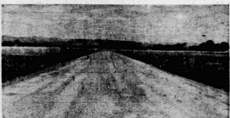
NEW STREET UNDER CONSTRUCTION