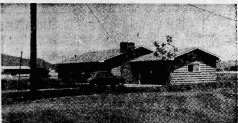
NEW HOME UNDER CONSTRUCTION