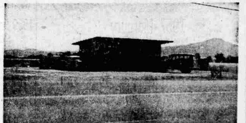
PORTER LUMBER CO.'s NEW OFFICE