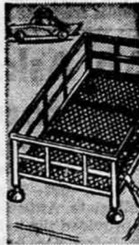
Regular 16.25 luggage rack!