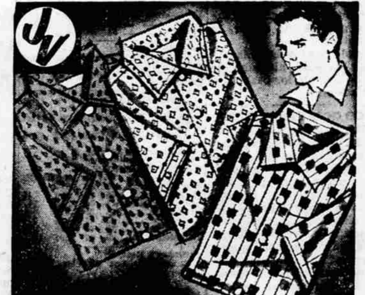
SPECIAL! Short-sleeve no-iron shirts for boys

What a buy at this low price! Casual sports shirts in colorful washfast patterns that you'll be wise to scoop up by the armful. Tailored with cool-as-a-pool short sleeves, are completely Sanforized.* *Max. shrink. 1%