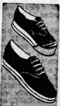
Women's OXFORDS SALE 1 99 FABRIC

60x72"—use for picnic tool Solid color or print cotton bark. 72x108" size.4.99