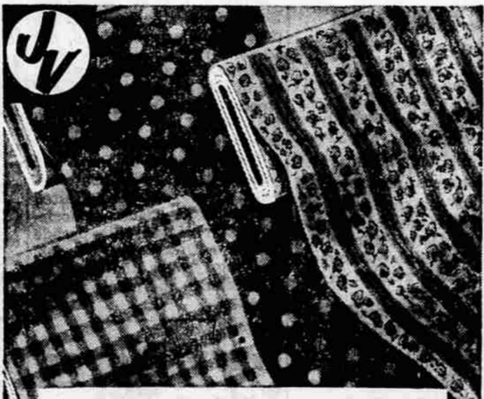
SALE! First quality 80 sq. percale prints

Ekco tri-ply saves time, fuel and space—"low" heat is all you need for quick, perfect cooking results. Self-nesting covers store easily. Hang-up handles oven-proof to 375°. Wonderful gift.