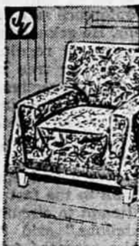
Regular 3.98 utility throws SALE 2 99

Big, all-metal rack with rubber suction cups and web hold-down straps. 42 by 37 by 7 inch size.