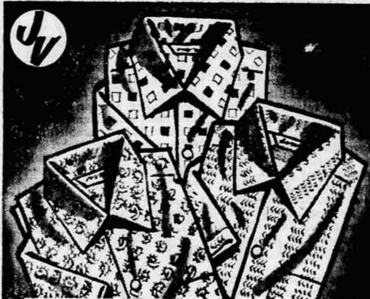
SPECIAL PRICE! Men's short sleeve shirts

6 transistors at a price usual for 4. Everything you want in a low-priced radio - power, shirt-pocket size and economy of operation. Plays on one low-cost battery. FREE earphone and leather carry case. High-impact cabinet.