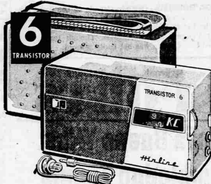
POWERFUL 6-transistor pocket portable radio

Comfort, perfect playshoes. Cotton duck, rubber soles. 3 1/2 to 10.